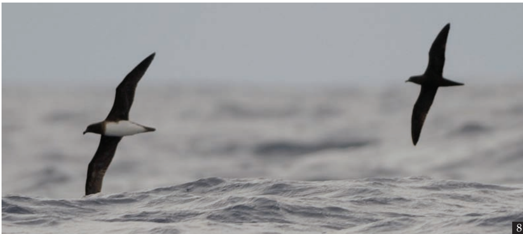
Figure 4. Fiji Petrel Pseudobulweria macgillivrayi , off Gau, Fiji, 13 May 2009. Another photograph of bird 2 while gliding, showing dorsal coloration to be generally concolorous and lacking any pattern