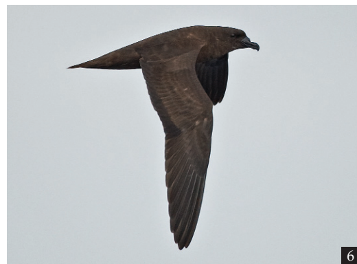
Figure 3. Fiji Petrel Pseudobulweria macgillivrayi , off Gau, Fiji, 13 May 2009. Bird 2 showing ventral side while arcing. Note typical Pseudobulweria structure; relatively large bill, proportionately long wings and slim elongated rear end. In natural light the entire underparts, fore and inner underwing-coverts and axillaries are dark brown whilst the remiges are fractionally paler / greyer, with no apparent pattern below